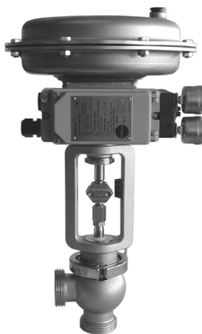
Bar stock body with threaded connections