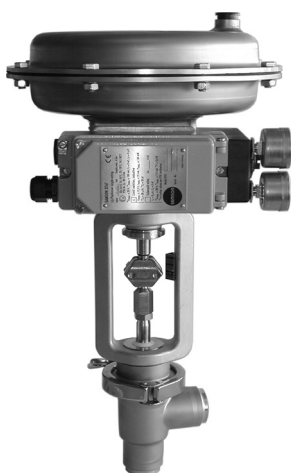
Hollow-mold cast body with welding ends