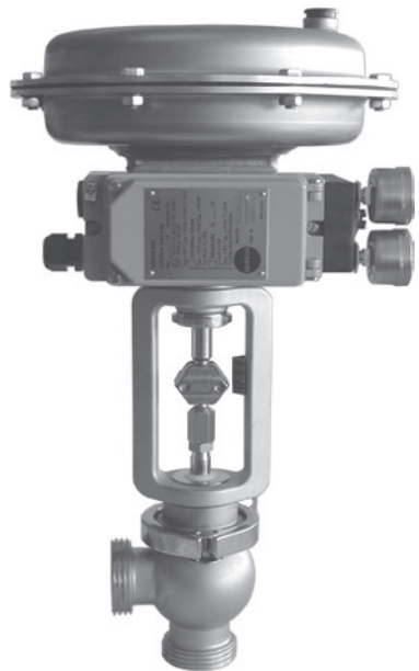
Type 3347-7, bar stock body with threaded connections