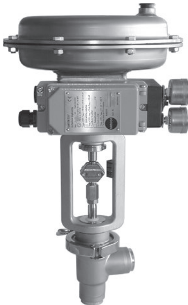
Type 3347-7, cast body with welding ends