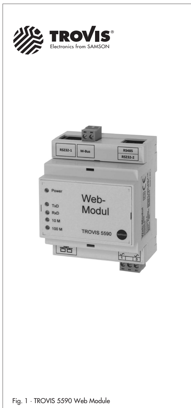
Fig. 1 · TROVIS 5590 Web Module

The web module editor software tool is used to create applications for the web module. This tool allows users to configure all functions over intranet/internet and, for example, to alter user access rights and e-mail addresses.