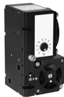
Fig. 1 · Type 3434-1 P Controller Module

Controller Module Type 3434- ... Output 0.2 to 1 bar or 3 to 15 psi