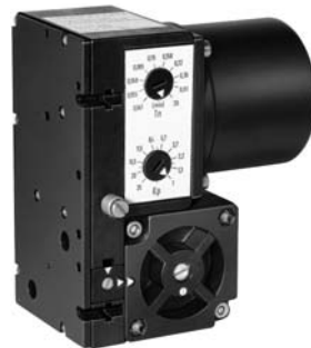
Fig. 2 · Type 3434-2 PI Controller Module