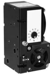
Fig. 1 · Type 3434-1 P Controller Module

Controller Module Type 3434- ... Output 0.2 to 1 bar or 3 to 15 psi