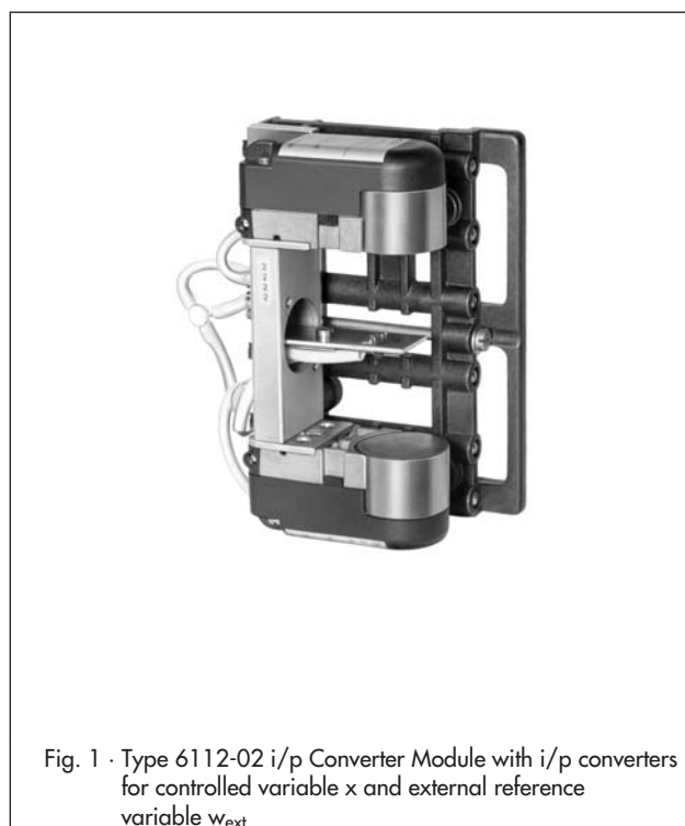
Fig. 1 · Type 6112-02 i/p Converter Module with i/p converters for controlled variable x and external reference variable w_{ext}

Type 6112-22 · i/p converter module like Type 6112-02, but with Ex II 2G EEx ia IIC T6 explosion protection according to ATEX.