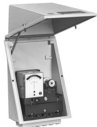
Fig. 2 · Type 3425 Pneumatic Controller with Type 3426-3 Field Housing and Type 3423-2 PI Controller Module