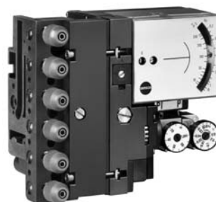
Fig. 1 · Type 3425 Pneumatic Controller with Type 3426-2 Control Room Housing and Type 3423-5 P/PI Controller Module

The Type 3427 Manual Control Units and the Type 3422 Control Stations without components are available in various versions that are adapted to the control tasks (circuit 1, 2 and 9). The schematics on page 3 are assigned to certain control circuits. The manual control unit with components and the controller version is adapted to the control task.