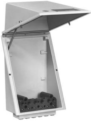
Fig. 3 · Type 3426-3 Field Housing equippable with: