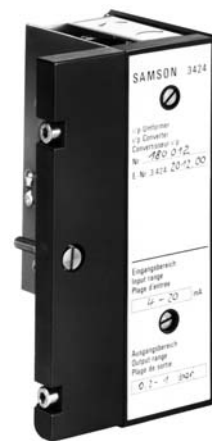
Fig. 2 · Type 424-11 i/p Converter for mounting alone with cover plate for output connections

Upon request also available with i/p converter for controlled variable x and/or i/p converter for external command variable w_{ext} . Details upon request.