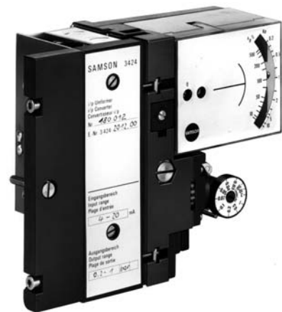
Fig. 1 · Type 424-10 i/p Converter with Type 423-2 PI Controller Module

Type 424-21 · Additional Module for mounting alone (without controller module) in Type 422 Manual Control Station with cover plate for the output connections, maximum air supply > 1.5 m 3 /h.