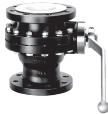
Fig. 1 · Type BR 21a Tank Bottom Valve

Note: Prior to using the tank bottom valve in hazardous areas, refer to the maintenance instructions BA 20a concerning its use according to ATEX 94/9/EC.