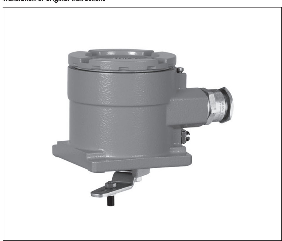
Type 4749 Position Transmitter