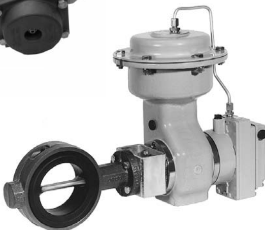
Fig. 1 · Type 3335/3278 with attached positioner