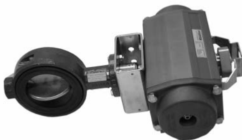
Fig. 2 · Type 3335/AT