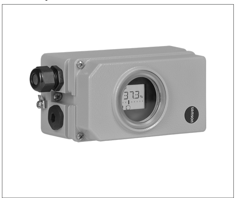
Type 3730-3 Electropneumatic Positioner