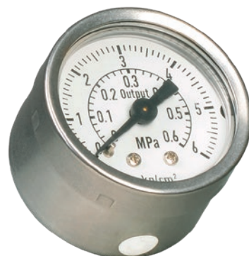
Fig. 2: Output pressure gauge with outer scale 0 to 6 kg/cm 2 and inner scale 0 to 0.6 MPa