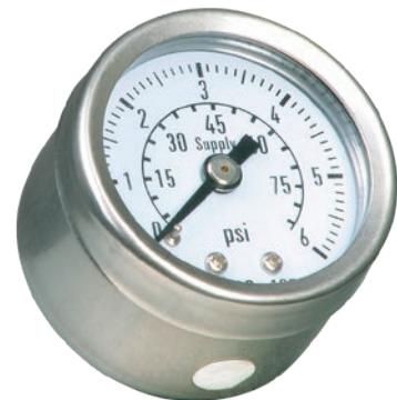
Fig. 1: Supply pressure gauge with outer scale 0 to 6 bar and inner scale 0 to 90 psi