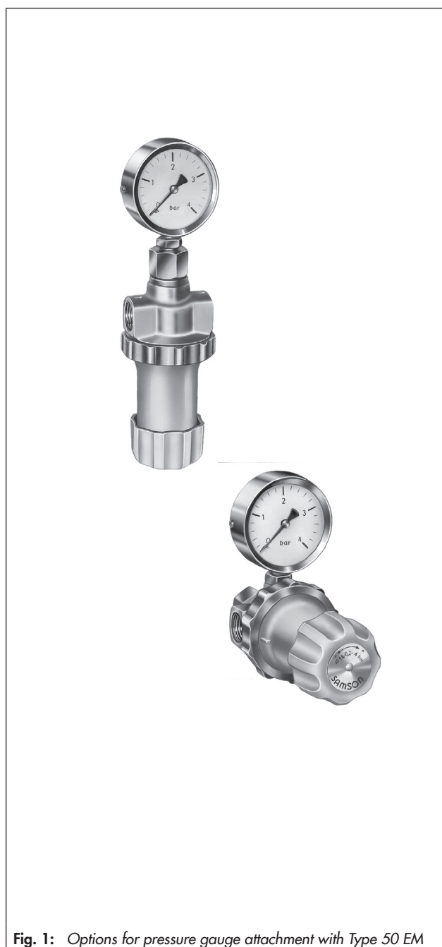
Fig. 1: Options for pressure gauge attachment with Type 50 EM