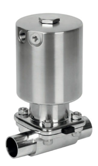
DN 15 - 50 Cf. 4, 5, 6