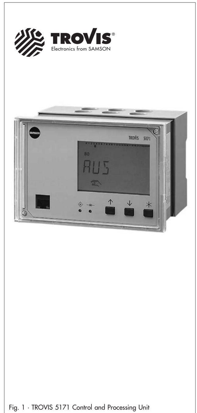
Fig. 1 · TROVIS 5171 Control and Processing Unit