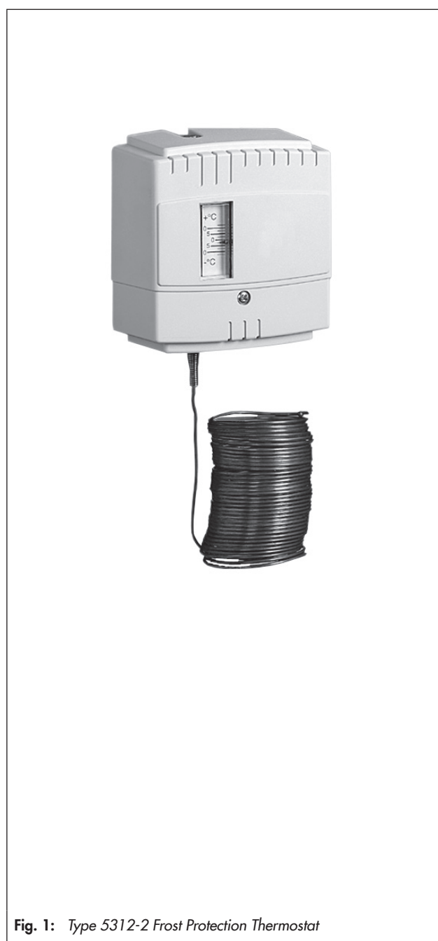
Fig. 1: Type 5312-2 Frost Protection Thermostat