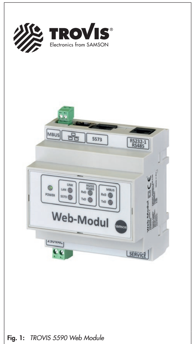
Fig. 1: TROVIS 5590 Web Module

The web module editor software tool is used to create applications for the web module. This tool allows users to configure all functions over intranet/internet and, for example, to alter user access rights and e-mail addresses.