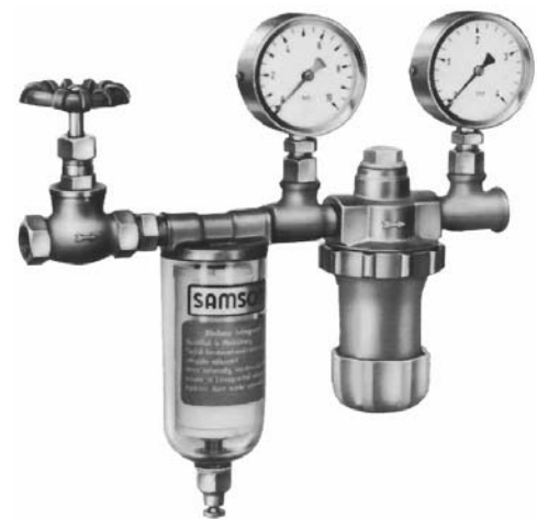
Fig. 1 · Type 707-1 Reducing Station

Type 707-3: With pressure reducing valve, connection G \frac{1}{2}